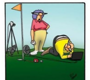
"This is still just a game to you, right?"

Announcing the 2023 Divorce Open November 16 ~ 18