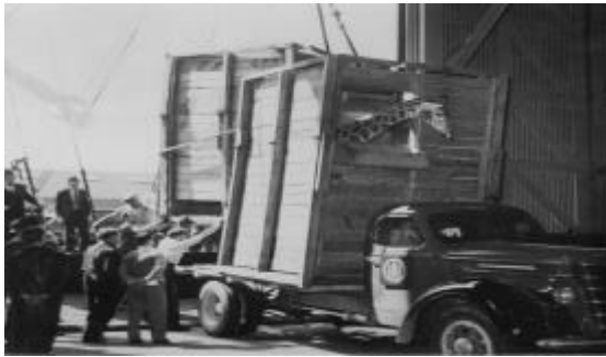
The hurricane survivors loaded into their crates in New York.

"West With Giraffes" is part adventure, part historical saga, and part coming of age love story. Who knew that a story about giraffes could be so captivating?