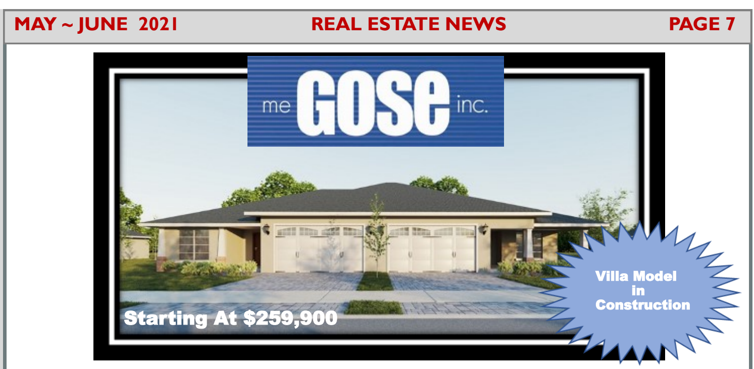
Golfsíde Víllas at Híghlands Rídge