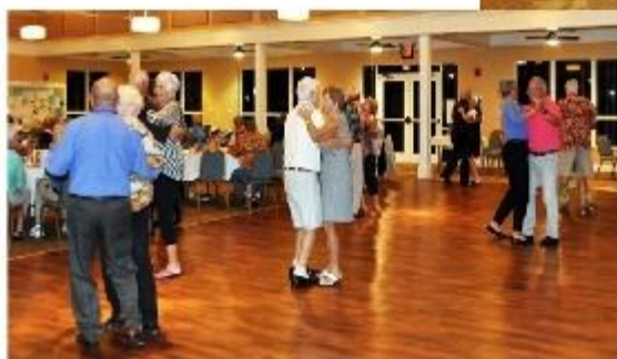
Gasparilla Event Fun had by All